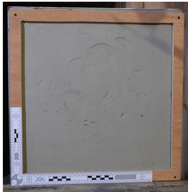
Figure 2 Creation of air-gap; plywood picture frame on calibrated Plastilina block.

After 10 shots on each armour pack, Plaster of Paris was used to fill the BFSs in the Plastilina block located behind the armour pack. After solidification, the BFS moulds were stored in resealable polymeric bags to maintain water homeostasis. The mass (gram), volume (cubic centimetre) and base surface area (square centimetres) of the BFS moulds were determined. BFS mould mass was measured using calibrated Mettler Toledo PB153 scales. The volume of the BFS mould was calculated by comparing the mass of each BFS mould to that of a standard