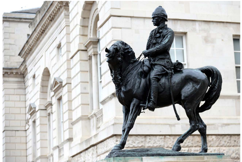
Figure 2 Statue of Field Marshal Lord Roberts and his charger Vonolel, Horse Guards Parade, London.

sporadic cases and clusters of cases still exist. It is fundamental to a successful outcome that such cases are diagnosed quickly, accurately and treated with the appropriate medication. All close contact individuals must be identified quickly and offered appropriate chemoprophylaxis and vaccination if appropriate. There is clear epidemiological evidence, from military and civilian populations, that the increased risk is primarily associated with young adults from diverse geographical areas congregating in confined conditions, who then share different meningococcal strains, which may correlate to new acquisition of a different meningococcus strain, in some cases. This is the rationale for advocating the immunisation of new recruits at commencement of their training, since this is the time they are at highest risk. Additionally, all military personnel should be offered vaccines targeting the most common serogroups prevalent in the geographical regions to which they are deployed. The epidemiology of meningococcal disease has constantly been changing. Molecular characterisation methodologies and continual monitoring of strains circulating globally will enable the early detection of potential new outbreak or cluster strains, which will further direct vaccination policy, both within military and civilian populations.