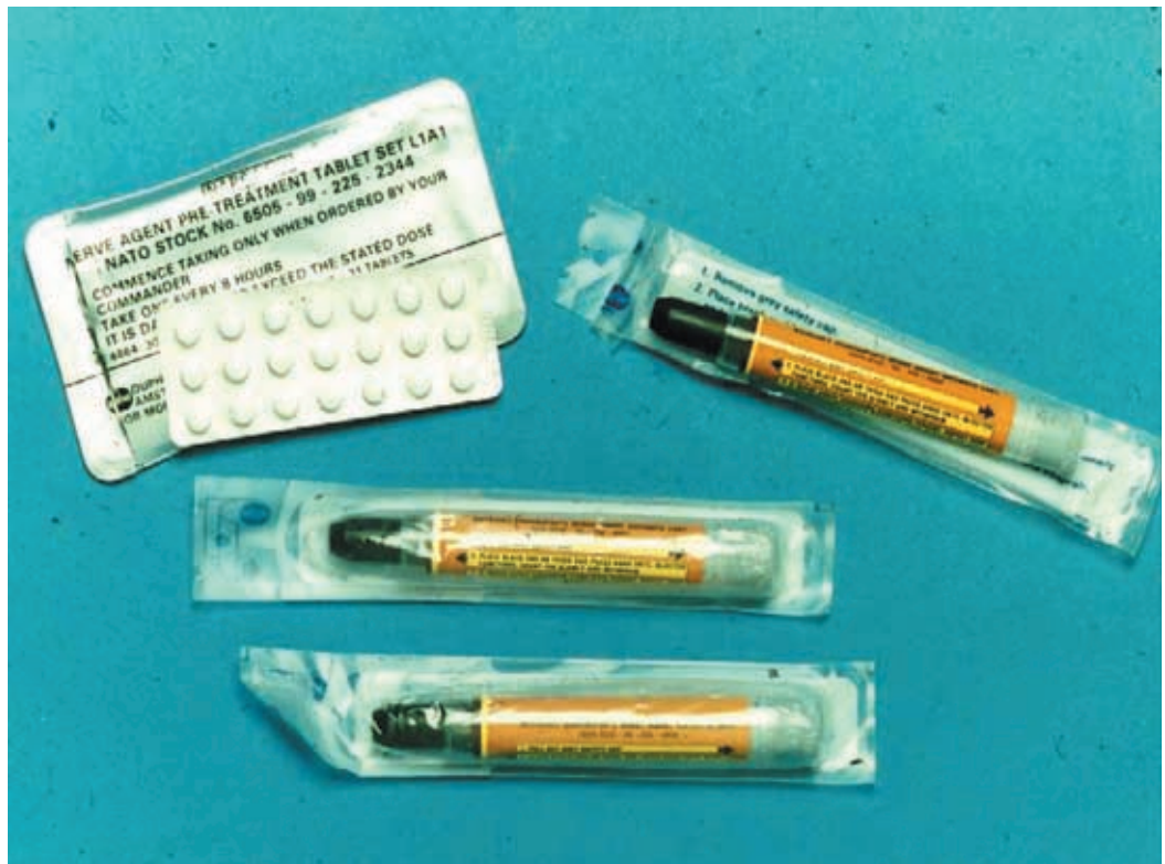
Fig 15. NAPS, and Combopen Autoinjectors.