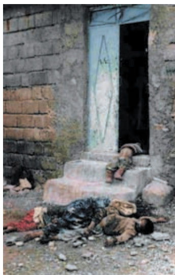
Fig 13. Dead in Halabja, Iraq, probably from GB.

Figure 13 shows victims in Halabja, Iraq from the probable use of GB in March 1998 (although UN Inspectors consider that the deaths may have resulted from the use of hydrogen cyanide).