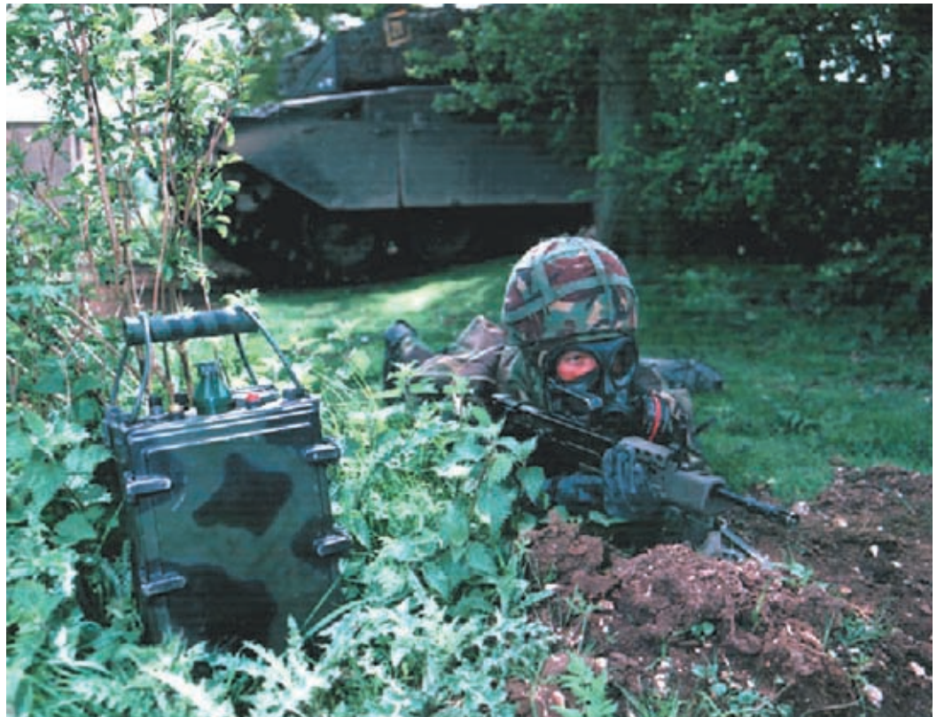
Fig 11. Nerve Agent Immobilised-Enzyme and Detector (NALAD). This was the world's first biologically-based nerve agent detector.

presence, of a nerve agent. In addition, it is recommended that the eyes are shut whilst masking.