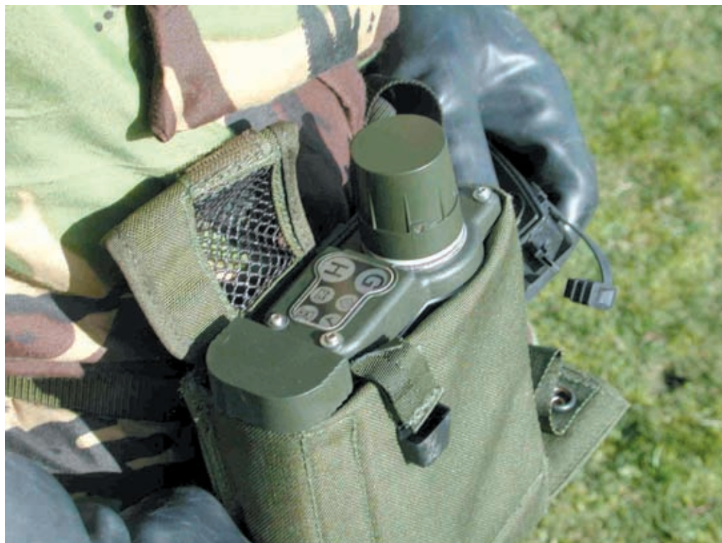
Fig 9. Lightweight Chemical Agent Detector (LCAD) shortly to enter service. It uses ion mobility spectrometry to detect CW agents.

To prevent inhalation of an incapacitating or lethal dose, it is essential that the breath is held and the respirator put on at the first warning of the presence, or suspected