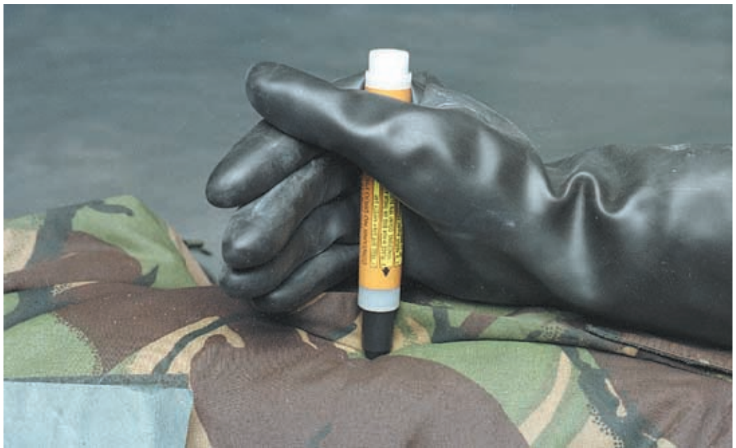
Fig 16. Self-injection using a ComboPen.

administration are alternatives, and recommended until significant hypoxia is corrected, as in such cases intravenous administration of atropine may precipitate life-threatening ventricular arrhythmias. In the Iran-Iraq War, intravenous infusion of atropine at 2 mg/min for over an hour was administered with considerable success for casualties severely poisoned by nerve agent vapour who had not received pre-treatment. In severe cases that have previously received pre-treatment, it is estimated that 30 – 50 mg of atropine in total may be required to achieve atropinisation.