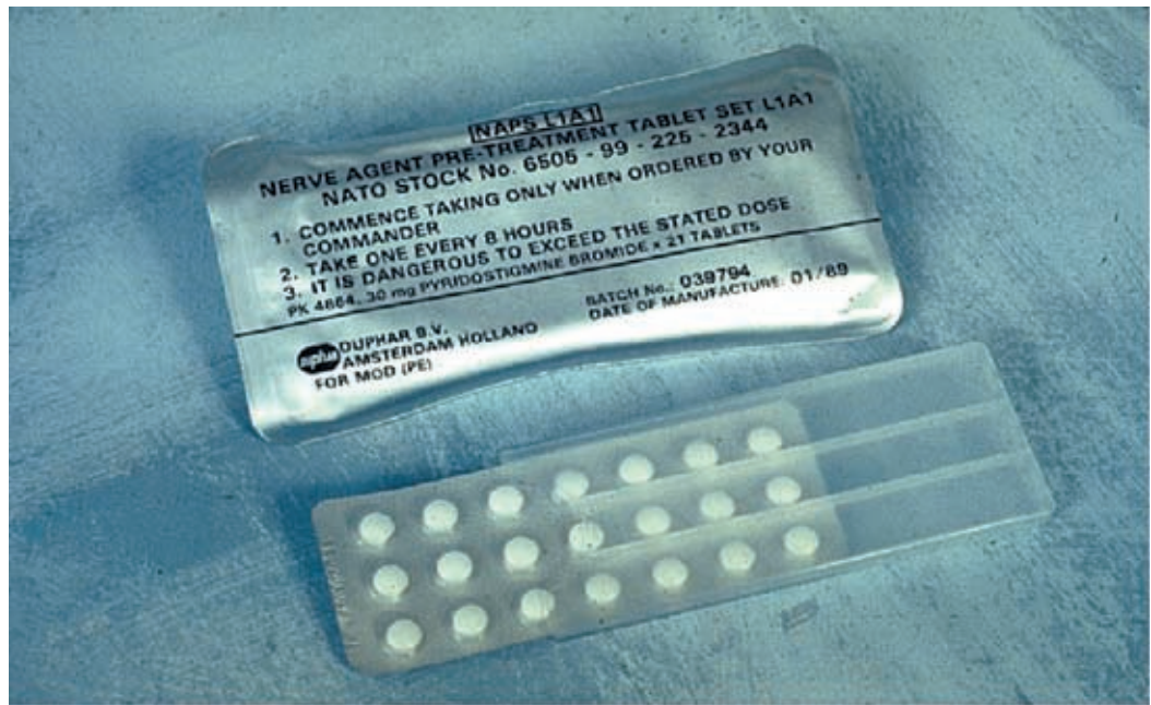
Fig 14. Nerve Agent Pre-treatment Set (NAPS) – Pyridostigmine.

agent. There are no significant signs and symptoms associated with this level of inhibition since: