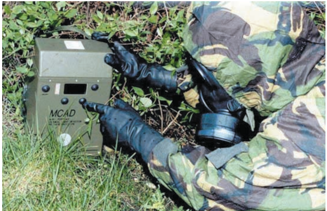
Fig 10. Man-Portable Chemical Agent Detector (MCAD) shortly to enter service.