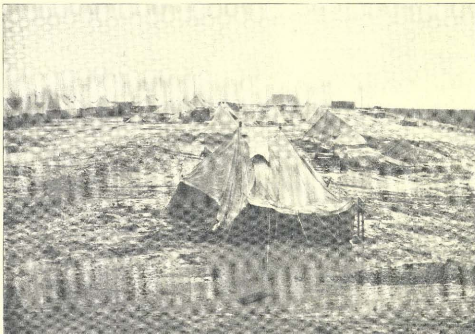
FIG. 1.—A camp on the second day of the rains.

Those for whom billets were not at once available were accommodated in tents, but as the rains were expected to break in mid-November efforts were made to have all troops in billets before then. This was not, however, managed and some troops had to move into hastily found billets when their camping ground was rapidly converted into a quagmire. Fig. 1 shows the appearance of a camp site on the second day of the rains.