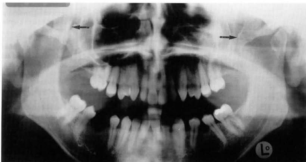
Fig 1. Panoramic radiograph showing coronoid process (arrowed).

Morrison Hospital, Swansea, S. Wales, SA6 6NL